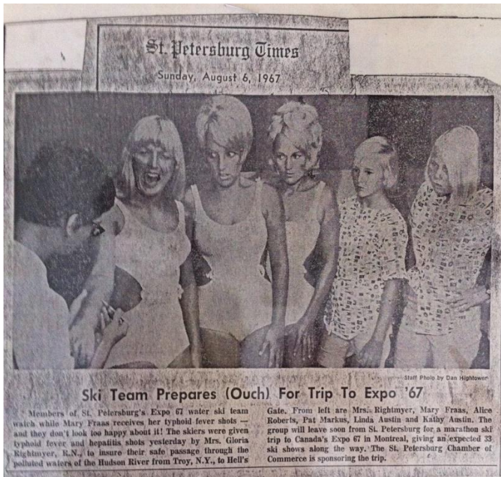
We had to get vaccinations because of the polluted water we would be skiing in.